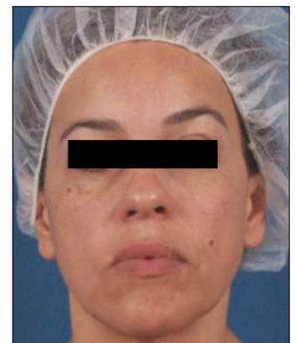
Figure 4: A 45 year old female.