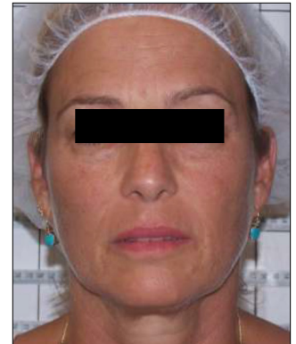
Figure 2: A 53 year old female.