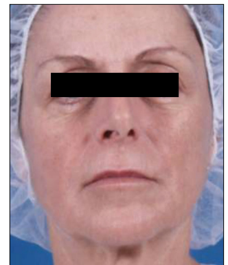
Figure 3: A 55 year old female.